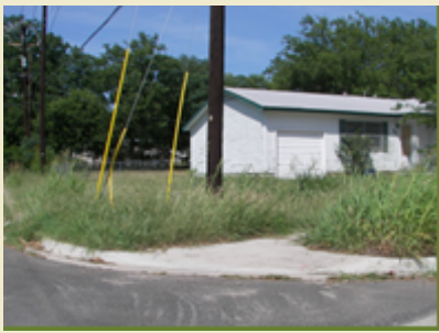
Weedy Lots/Alley-Over 12 inches 10 Days to Comply/ from Regular Mail Letter *Sec. 42-36 (a)