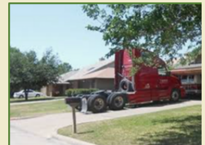
18 Wheelers in Residential Property 10 Days to Comply/ from Certified Letter *Sec. 110-384 (b) (6)