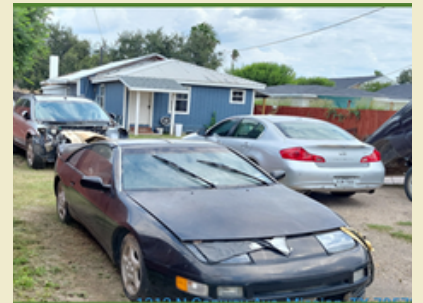
Storage of Vehicles in Residential Properties 15 Days to Comply/ from Regular Mail Letter *Appendix A - Article VIII- Sec. 1.371 (3) (h)