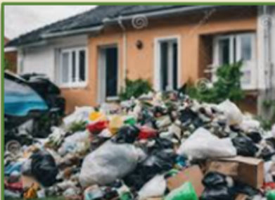
Health & Sanitation 10 Days to Comply/ from Regular Mail Letter *Sec. 42-32 (a)