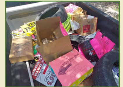
Illegal Signs/Garage Sale Signs-Signs in Right of Way/Telephone Poles Corrected/Removed at Site *Sec. 86-9 & Sec. 82-44 (c)