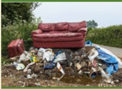
Illegal Dumping 2 Days to Comply/ from Warning Citation *Sec. 90-3 (a) (b)