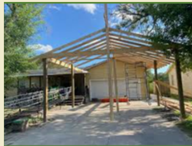
Construction w/o Permit 15 Days to Comply/ from Regular Mail Letter *Sec. 18-32 IBC Sec. 105.1