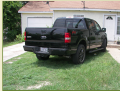
No Parking on the Grass 10 Days to Comply/ from Regular Mail Letter *Sec. 110-463 (a) (3)