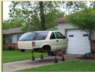
Junked Vehicles 10 Days to Comply/ from Certified Letter *Sec. 42-212