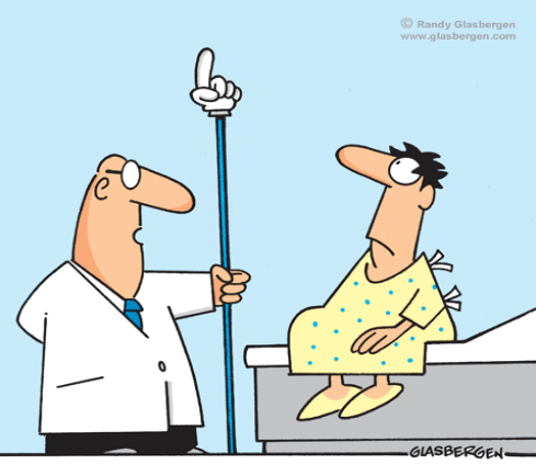
"Frankly, I don't enjoy prostate exams any more than you do!"