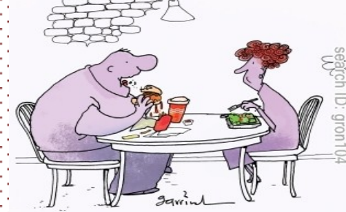
l eat cheap greasy food so I can save for my cardiologist bills in the future.